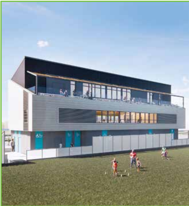
► Rendering of new fieldhouse facility and bleachers

The third and final phase of the Inlet Park Redevelopment Project – construction of a new fieldhouse facility – is expected to begin this summer.