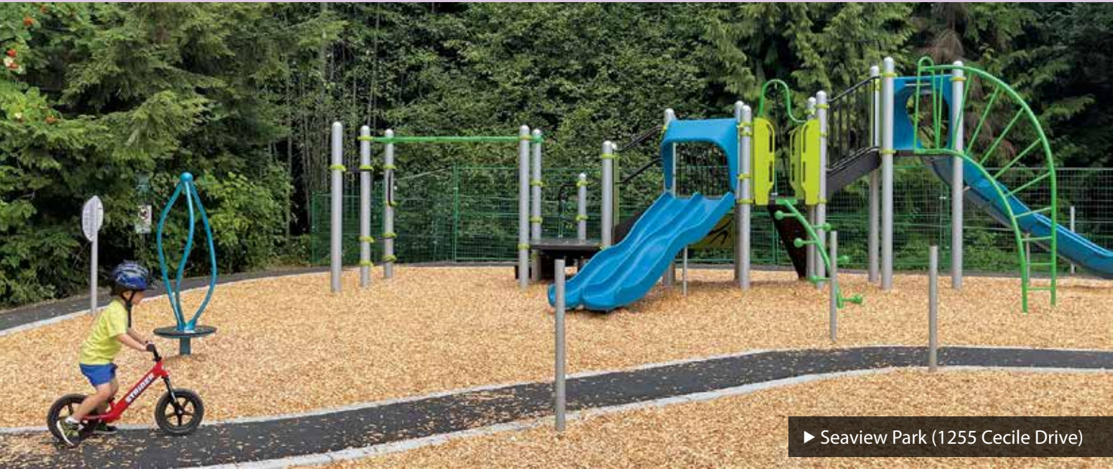
► Seaview Park (1255 Cecile Drive)