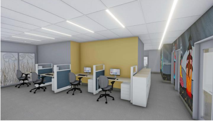
Breakout and Office Space