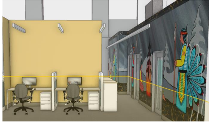
Care Team Touch Down: Staff Corridor 05