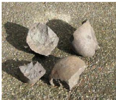
4. Fire cracked rock