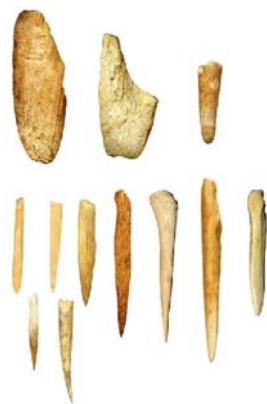
1. Bone and antler fragments