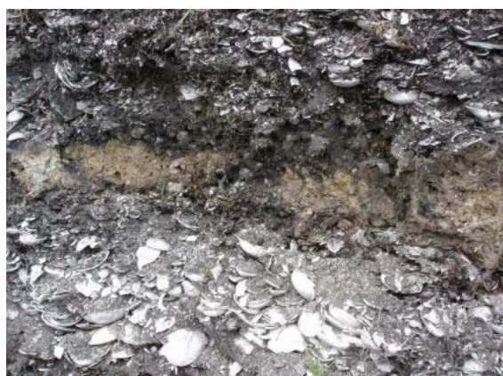
2. Shell midden