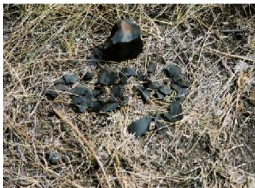
3. Chipped stone flakes