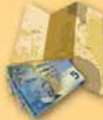
Local maps (identify a family meeting place) and some cash in small bills